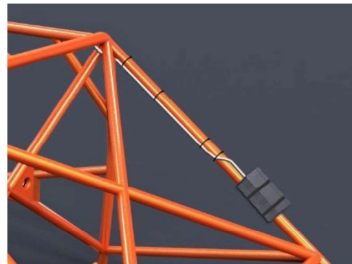
Connecting Cable – routed on inside of roll cage in order to avoid damage in event of car rolling etc.