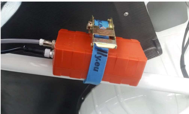
Receiver / Transmitter Unit

The receiver / transmitter unit is fixed to a bar of the roll cage in the rear of the car (using a small ratchet strap which is supplied) and the console is mounted in the centre front of the car such that both crew members can, both see and reach it, while belted in their seats . The connecting cable is then ran to the receiver / transmitter unit in the rear of the car, generally being cable tied ( cable ties not supplied ) to the bars of the roll cage. In routing the cable, care should be taken to ensure that the cable is fixed to the inside of the roll cage bars in order that it is not damaged in the event of an accident where the body panels are pushed against the roll cage.