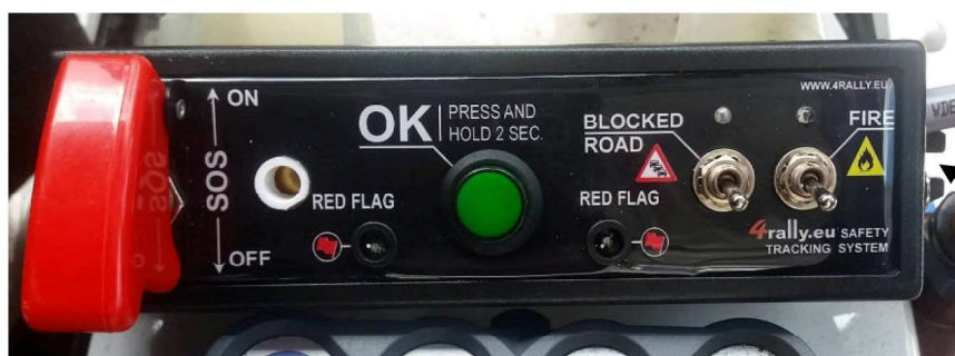
User Console – in reach of both crew members