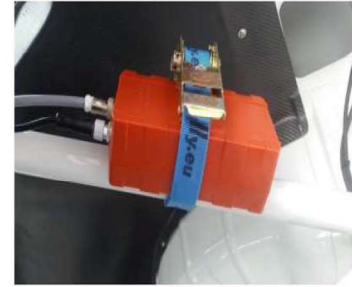
Receiver / Transmitter Unit

1) The main receiver / transmitter unit (an orange box) secured into position using the provided ratchet strap.